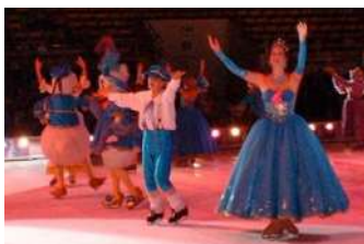
Show in Bukit Jalill, K.L. Disney On Ice: “Beauty & the Beast”